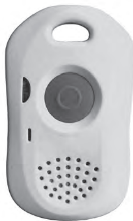
Additional Two-Way Pendants Part #41915