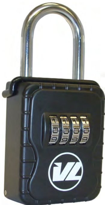
Lock Box Part #30913