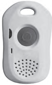
Pendant Part #41915

The items below are included with your System .