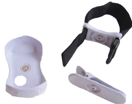
Wrist strap and Beltclip (Holster screws onto clip for beltclip or strap for wrist strap)