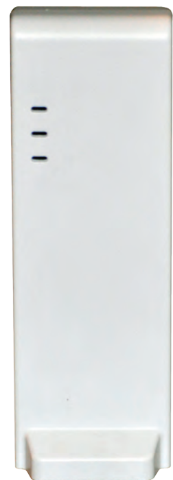
Cellular Accessory Part #40914ACC