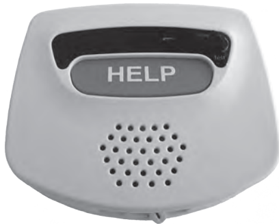
Emergency Wall Communicator Part #41920