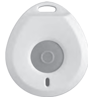
Additional Waterproof Pendants Part #40915