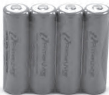
Rechargeable AA Batteries 4 Pieces Part #35918