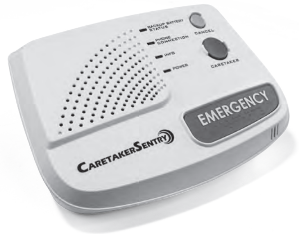
Base Unit Part #40914